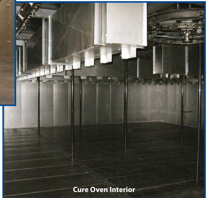
Cure Oven Interior