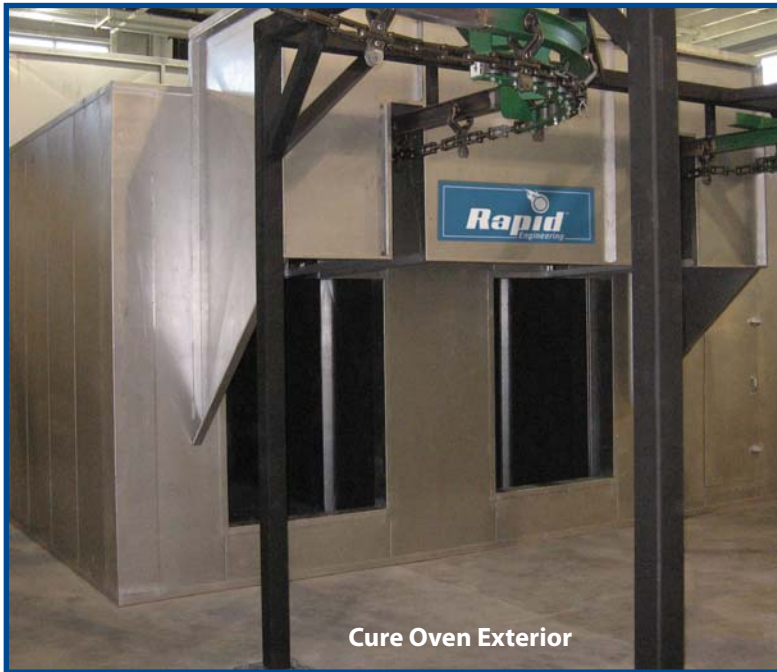
Cure Oven Exterior