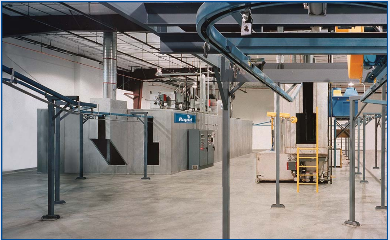
A typical RAPID™ finishing system with five-stage washer, dry-off oven, cure oven, conveyor and controls.