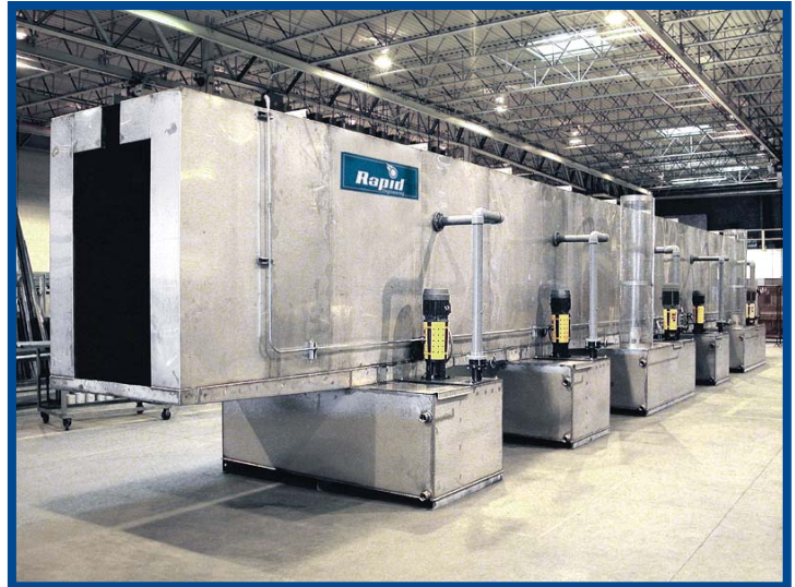
The RAPID™ Econo series multi-stage washer was specifically designed to meet common manufacturing product sizes and required production throughput from 4 to 8 feet per minute.