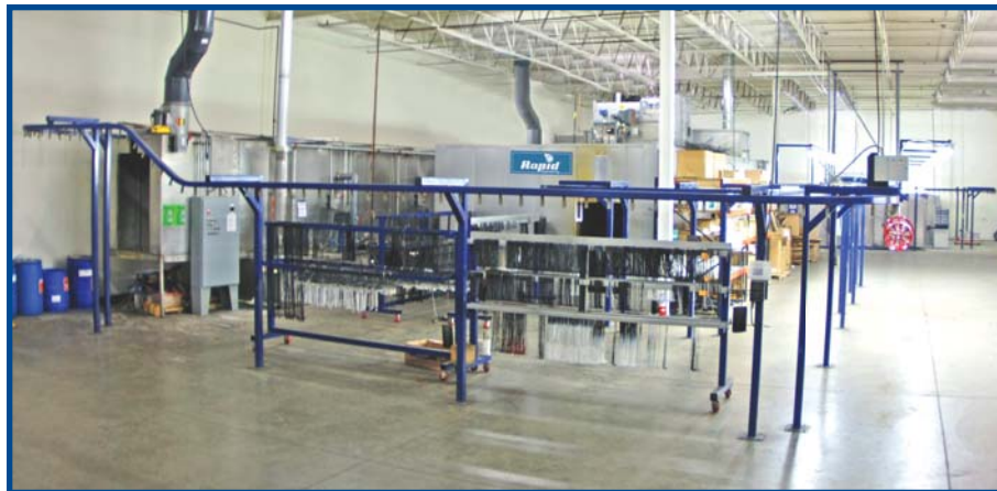
RAPID™ Econo-Series Finishing System Application