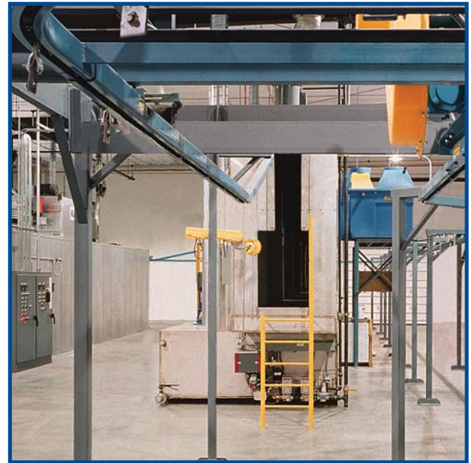
RAPID™ Econo-Series Washer