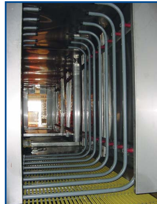
Econo-Series Washer Interior